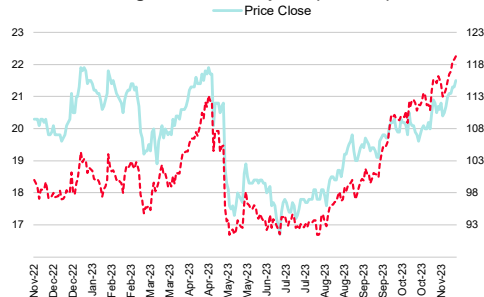
Bangkok Chain Hospital (BCH TB)